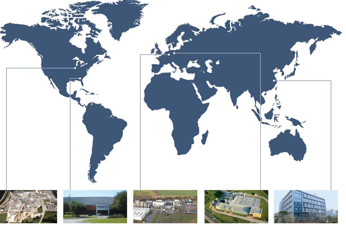
Millsdale, IL, USA